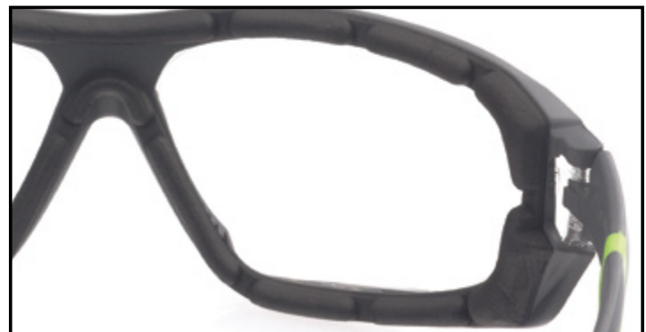
Ventilated foam insulation