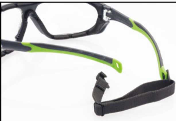
Detachable, adjustable strap